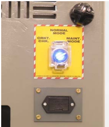
Door Mount ARM Switch

be conducted and the energy level downstream calculated. Then a label should be created and installed on the downstream equipment showing the arc flash level under normal conditions and the ARM conditions.