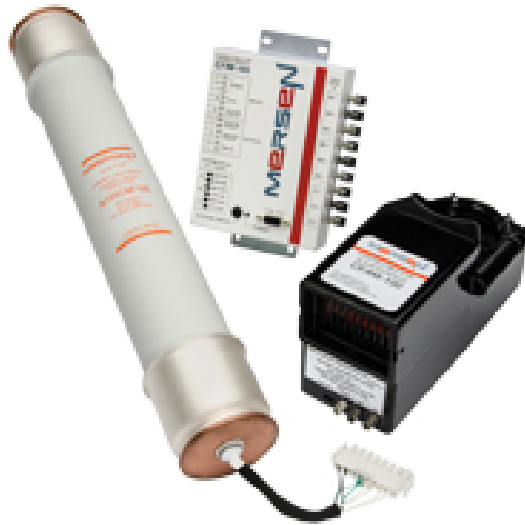
Medium Voltage Controllable Fuse (MVCF)

Remember, Distance and short time delays are your friends when it comes to the electrical arc flash hazards. Increasing the working distance or decreasing the tripping times lowers the arc flash energy exposure. There are many ways to reduce the tripping times of protective devices. The solutions are very equipment specific and just one solution can not be applied everywhere in a distribution system. Sound engineering analysis and design is needed to determine the best and most cost effective method to reduce the arc flash energy. Before you operate that electrical equipment, stop and think about ways to operate it remotely and/or decrease the upstream operating trip times. This could save your life!