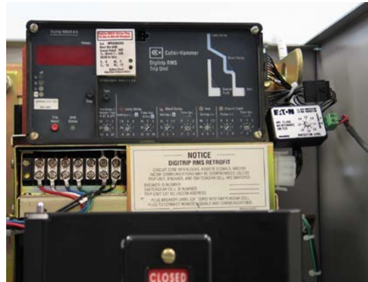
Breaker with Retrofitted Trip Unit and ARM Unit