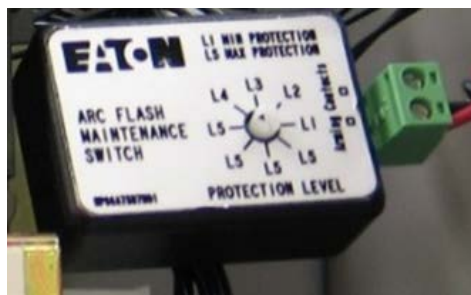
ARM Trip Unit